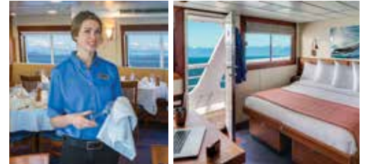
Clockwise from top: Lounge with full service bar and facilities for films, slideshows and presentations; Category 3 cabin; Dining room offering single seating meals and an informal atmosphere.