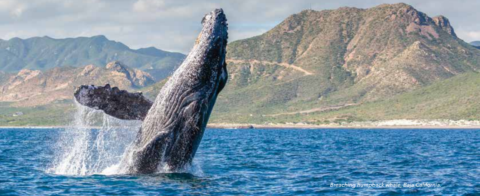
Breaching humpback whale, Baja California.