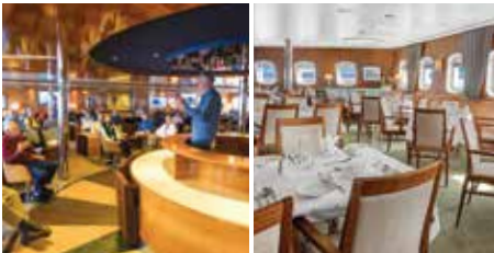
Clockwise from top: Newly renovated category 7 suite; The dining room has unassigned seating and an informal atmosphere; Enjoy daily presentations in the lounge.