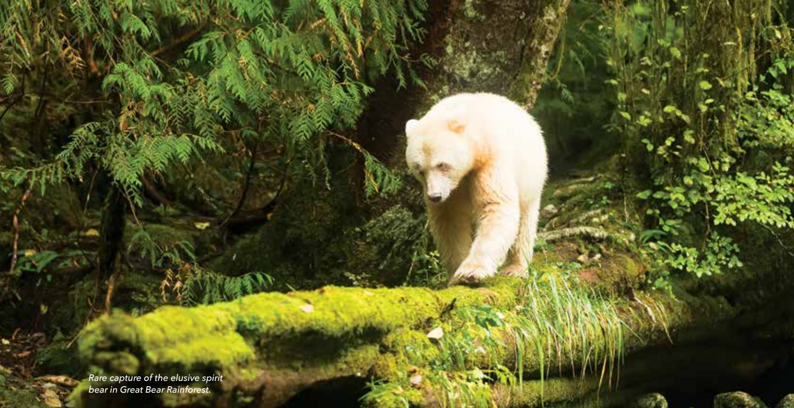
Rare capture of the elusive spirit bear in Great Bear Rainforest.