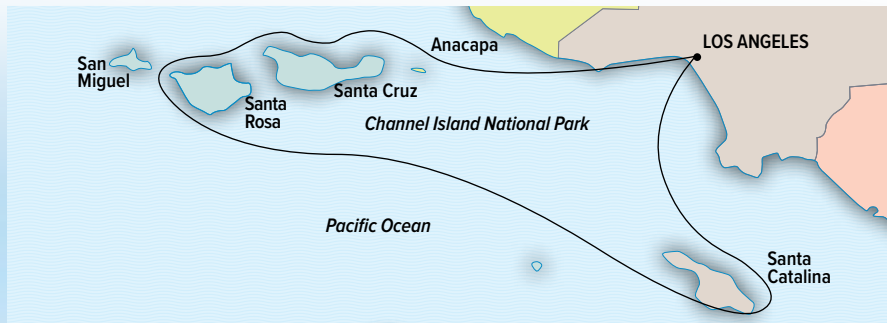
Anacapa Island, Channel Islands.