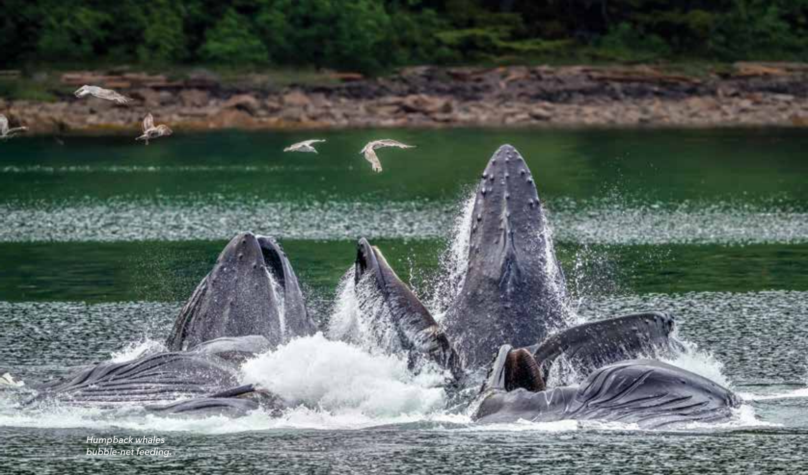
Humpback whales bubble-net feeding.