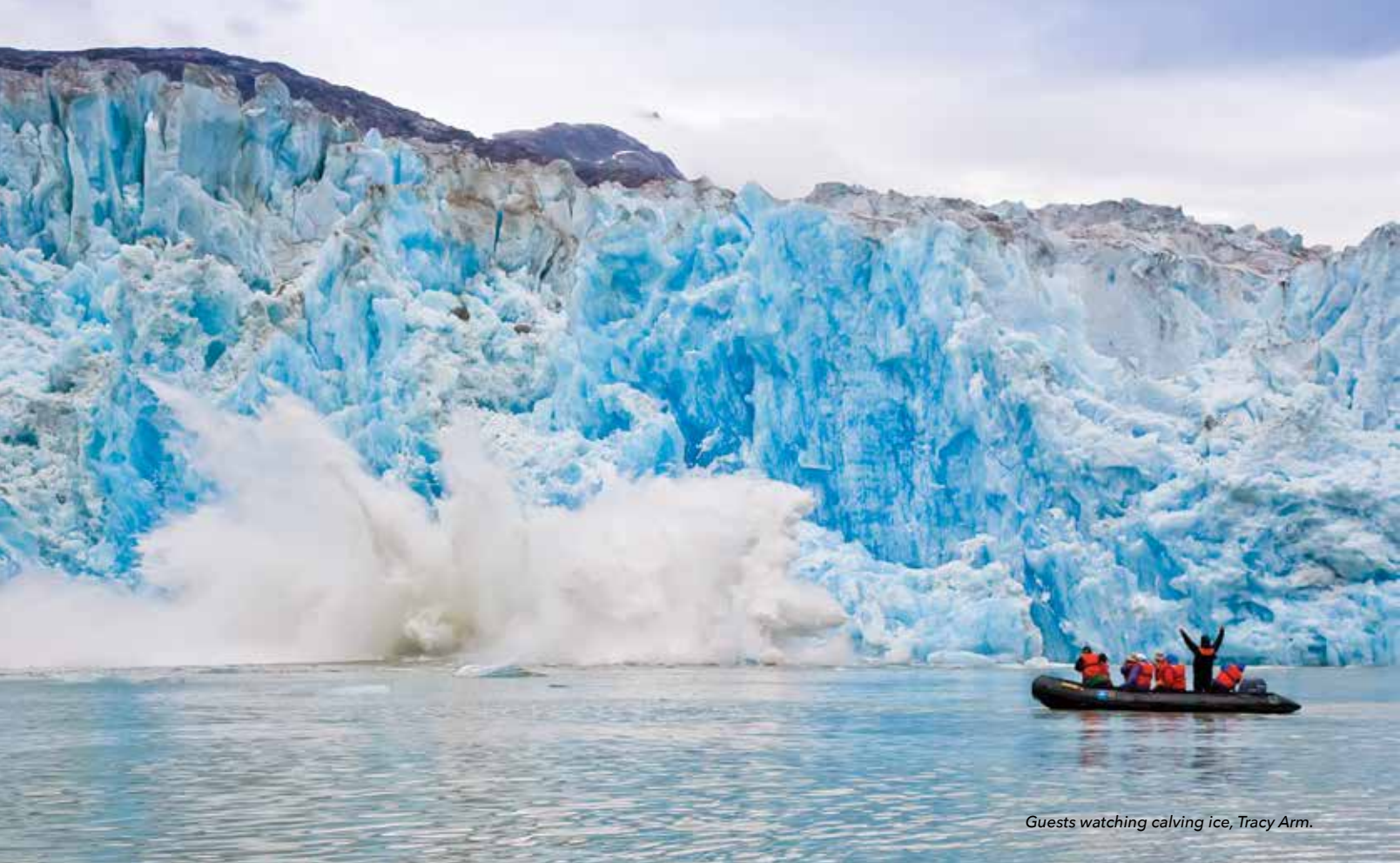
Guests watching calving ice, Tracy Arm.