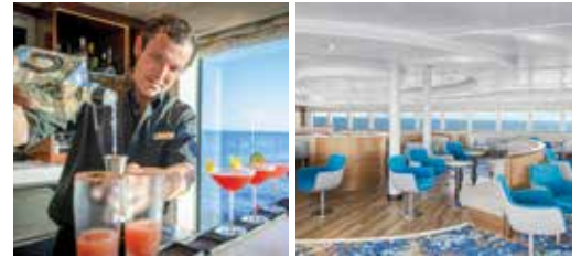
Clockwise from top: Category 5 cabin; Lounge with full service bar and facilities for films, slideshows, and presentations; Bartender creating cocktails on National Geographic Venture.