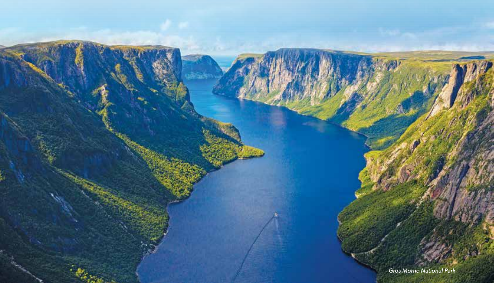
Gros Morne National Park.